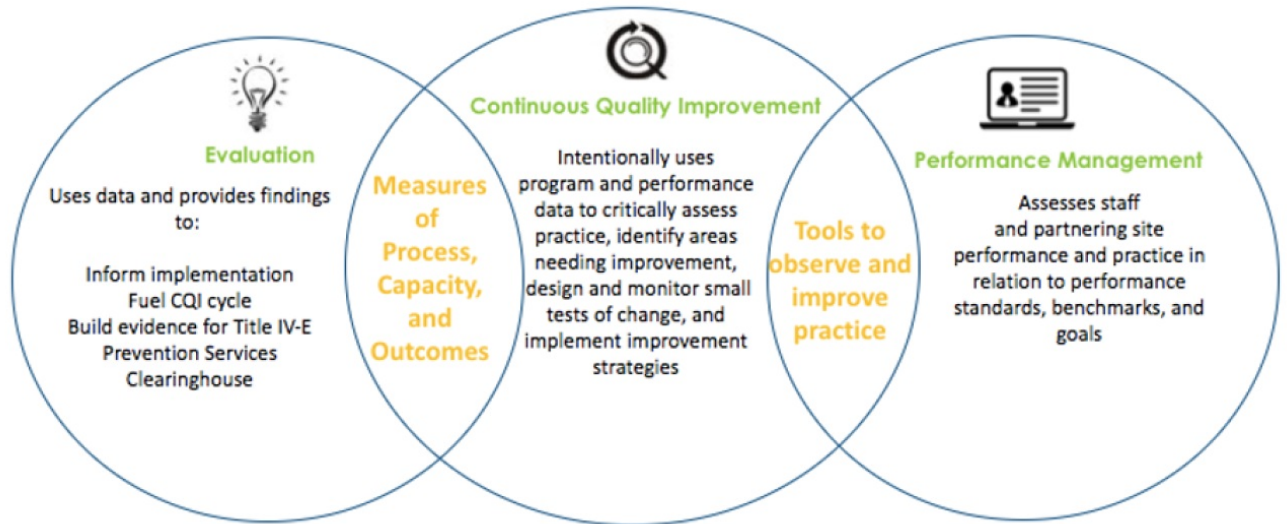
Figure 7: Relationship between OhioKAN CQI, Evaluation, and Performance Management

As shown in Figure 7, OhioKAN CQI is closely aligned with the program's evaluation activities and performance management framework. The findings from evaluation activities not only inform course corrections and build the evidence base for OhioKAN, but also fuel the CQI cycle. Similarly, CQI and performance management both assess staff and partnering site practice skills and use the same tools to observe and improve practice. While related to CQI, evaluation and performance management each represent distinct frameworks, whose relationships with CQI are further explained below.