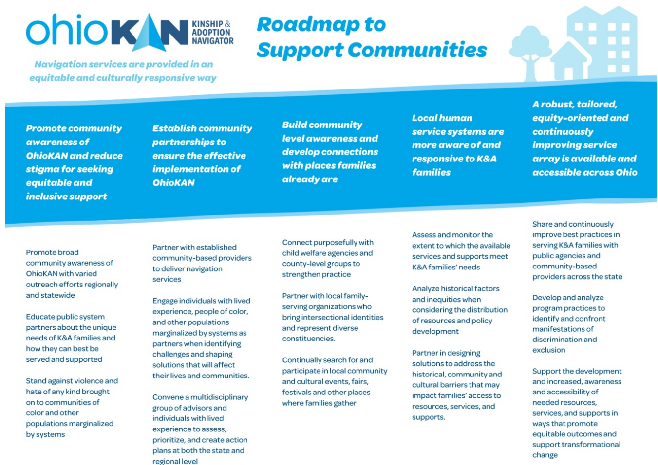
Figure 3. The roadmap to support communities demonstrates the activities and desired outcomes of OhioKAN service delivery in support of communities.