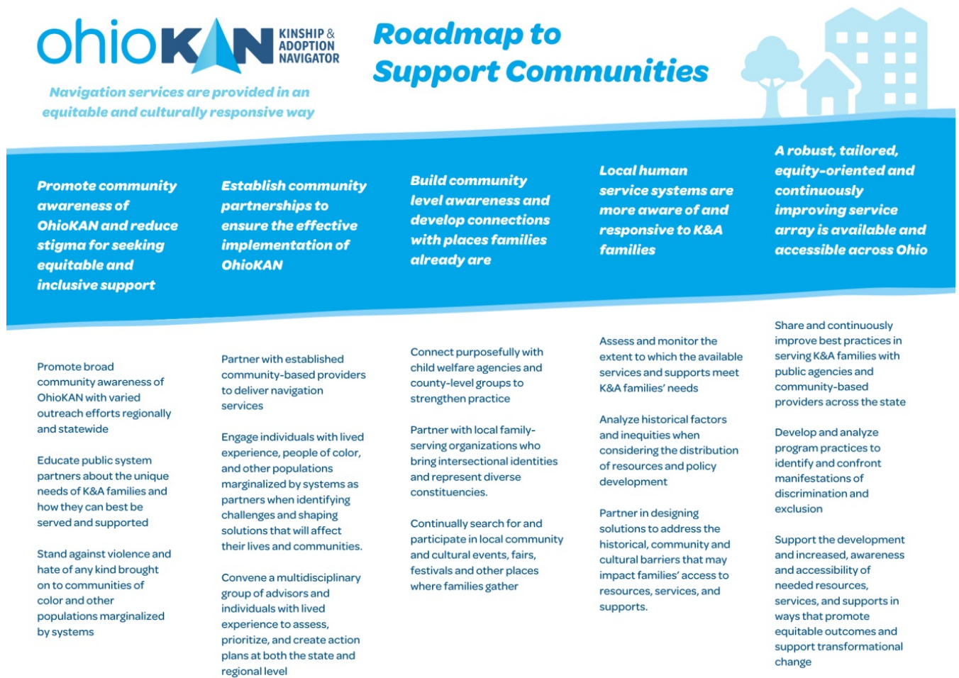
Figure 3. The roadmap to support communities demonstrates the activities and desired outcomes of OhioKAN service delivery in support of communities.